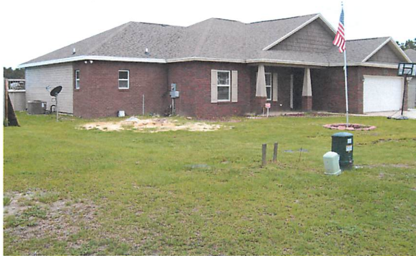
30 JUNE 2015 -- FRONT VIEW

If using the Elevation Certificate to obtain NFIP flood insurance, affix at least 2 building photographs below according to the instructions for Item A6. Identify all photographs with date taken; "Front View" and "Rear View"; and, if required, "Right Side View" and "Left Side View." When applicable, photographs must show the foundation with representative examples of the flood openings or vents, as indicated in Section A8. If submitting more photographs than will fit on this page, use the Continuation Page.