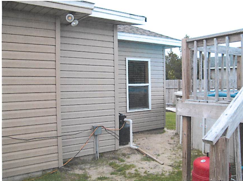
30 JUNE 2015 -- REAR VIEW