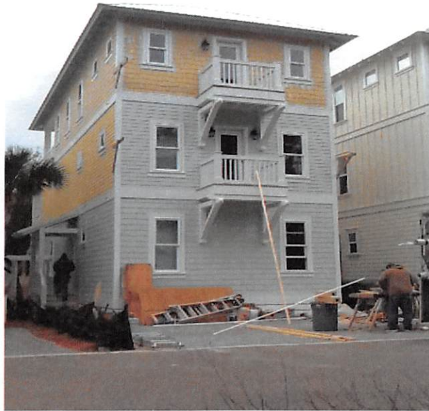
FRONT VIEW 02-24-2016

If using the Elevation Certificate to obtain NFIP flood insurance, affix at least two building photographs below according to the instructions for Item A6. Identify all photographs with: date taken; "Front View" and "Rear View"; and, if required, "Right Side View" and "Left Side View." If submitting more photographs than will fit on this page, use the Continuation Page, following.