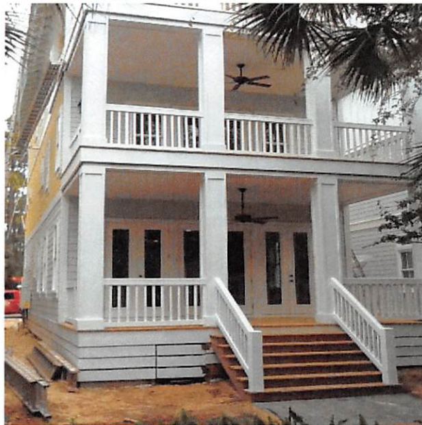
REAR VIEW 02-24-2016