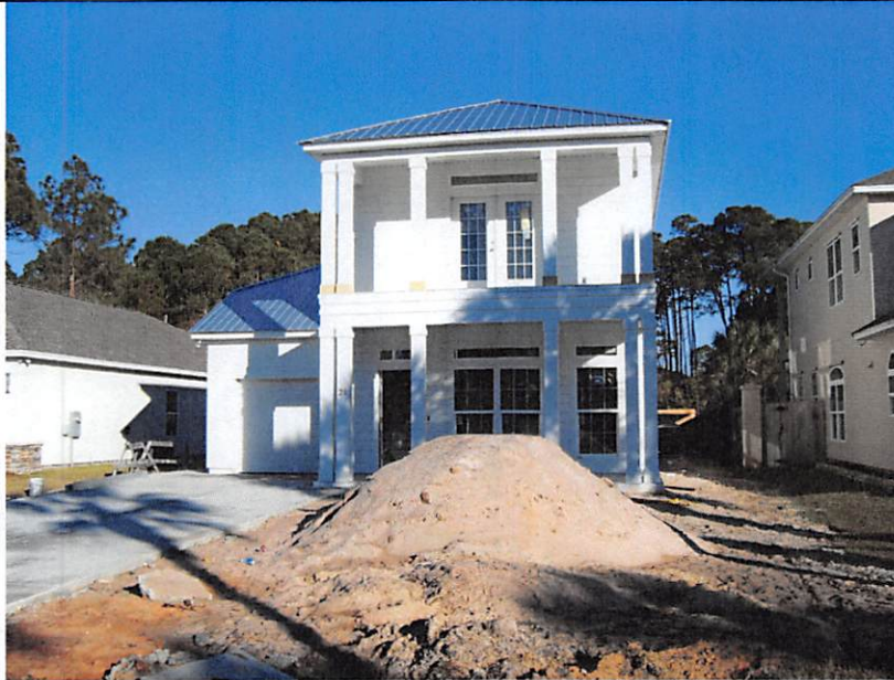
1 DECEMBER 2016 -- FRONT VIEW

If using the Elevation Certificate to obtain NFIP flood insurance, affix at least 2 building photographs below according to the instructions for Item A6. Identify all photographs with date taken; "Front View" and "Rear View"; and, if required, "Right Side View" and "Left Side View." When applicable, photographs must show the foundation with representative examples of the flood openings or vents, as indicated in Section A8. If submitting more photographs than will fit on this page, use the Continuation Page.