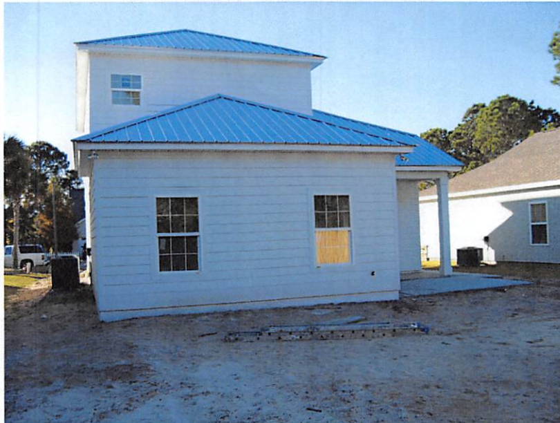
1 DECEMBER 2016 -- REAR VIEW