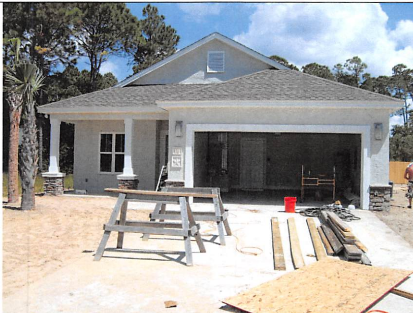
9 SEPTEMBER 2016 -- FRONT VIEW

If using the Elevation Certificate to obtain NFIP flood insurance, affix at least 2 building photographs below according to the instructions for Item A6. Identify all photographs with date taken; "Front View" and "Rear View"; and, if required, "Right Side View" and "Left Side View." When applicable, photographs must show the foundation with representative examples of the flood openings or vents, as indicated in Section A8. If submitting more photographs than will fit on this page, use the Continuation Page.