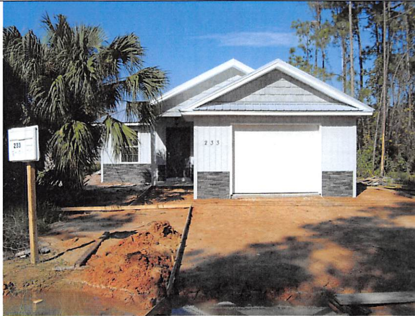
26 SEPTEMBER 2016 -- FRONT VIEW

If using the Elevation Certificate to obtain NFIP flood insurance, affix at least 2 building photographs below according to the instructions for Item A6. Identify all photographs with date taken; "Front View" and "Rear View"; and, if required, "Right Side View" and "Left Side View." When applicable, photographs must show the foundation with representative examples of the flood openings or vents, as indicated in Section A8. If submitting more photographs than will fit on this page, use the Continuation Page.