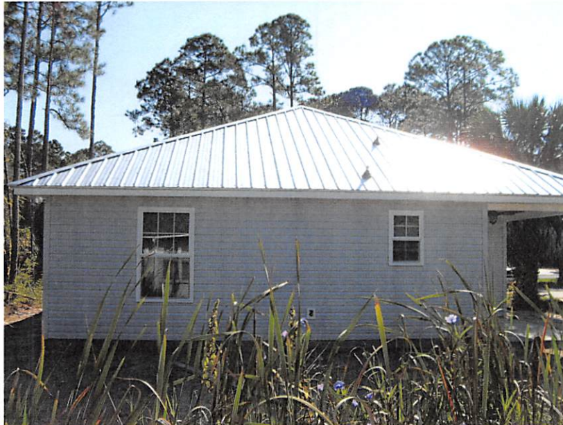
26 SEPTEMBER 2016 -- REAR VIEW