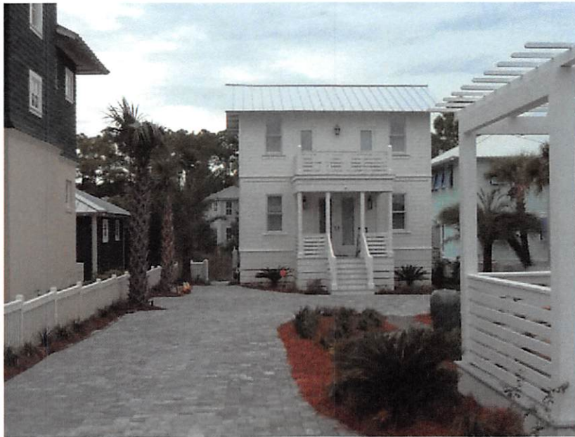
FRONT VIEW 9-01-2016

If using the Elevation Certificate to obtain NFIP flood insurance, affix at least two building photographs below according to the instructions for Item A6. Identify all photographs with: date taken; "Front View" and "Rear View"; and, if required, "Right Side View" and "Left Side View." If submitting more photographs than will fit on this page, use the Continuation Page, following.