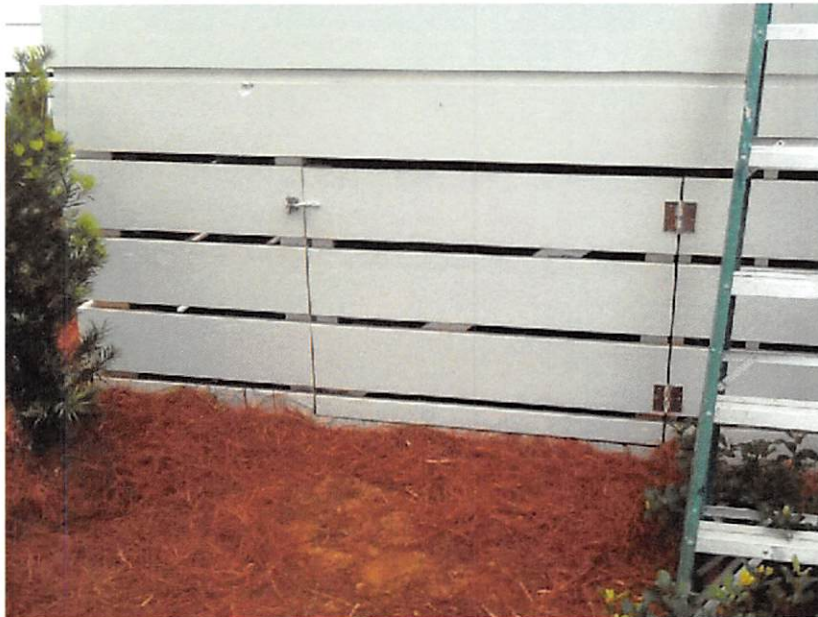
REAR VIEW 09-01-2016