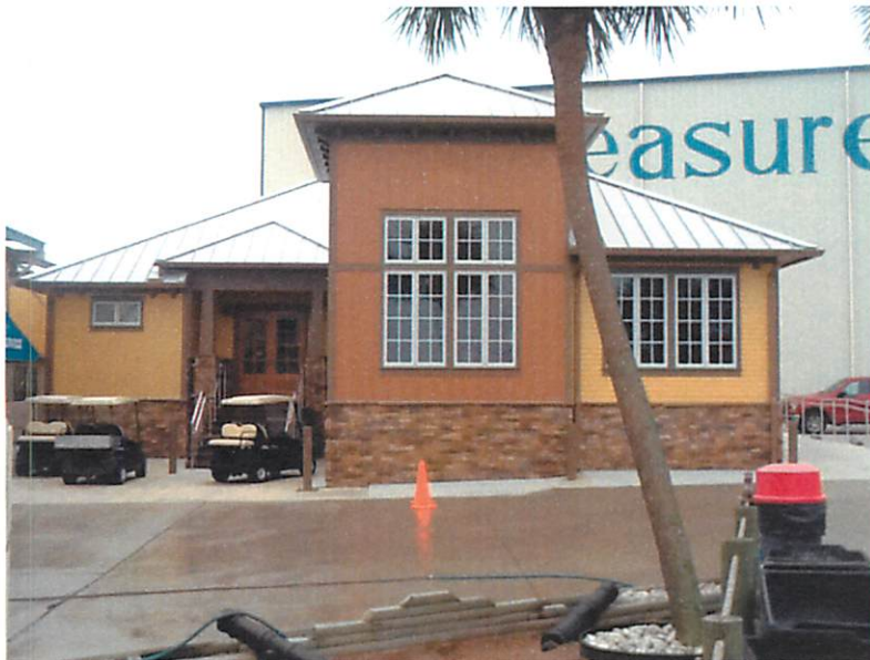
FRONT VIEW 11-14-2016

If using the Elevation Certificate to obtain NFIP flood insurance, affix at least two building photographs below according to the instructions for Item A6. Identify all photographs with: date taken; "Front View" and "Rear View"; and, if required, "Right Side View" and "Left Side View." If submitting more photographs than will fit on this page, use the Continuation Page, following.