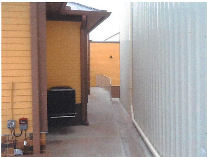
REAR VIEW 11-14-2016