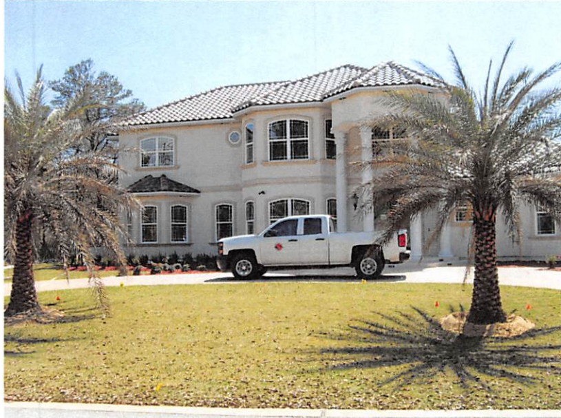
28 MARCH 2016 -- FRONT VIEW

If using the Elevation Certificate to obtain NFIP flood insurance, affix at least 2 building photographs below according to the instructions for Item A6. Identify all photographs with date taken; "Front View" and "Rear View"; and, if required, "Right Side View" and "Left Side View." When applicable, photographs must show the foundation with representative examples of the flood openings or vents, as indicated in Section A8. If submitting more photographs than will fit on this page, use the Continuation Page.