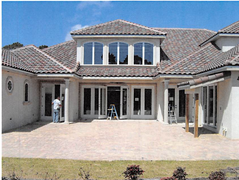
28 MARCH 2016 -- REAR VIEW