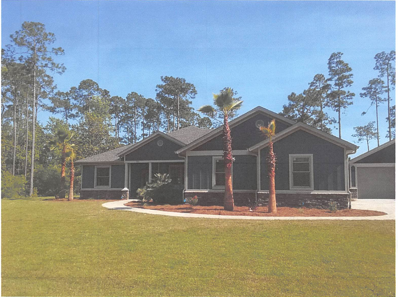
FRONT VIEW 5/12/2016

If using the Elevation Certificate to obtain NFIP flood insurance, affix at least 2 building photographs below according to the instructions for Item A6. Identify all photographs with date taken; "Front View" and "Rear View"; and, if required, "Right Side View" and "Left Side View." When applicable, photographs must show the foundation with representative examples of the flood openings or vents, as indicated in Section A8. If submitting more photographs than will fit on this page, use the Continuation Page.