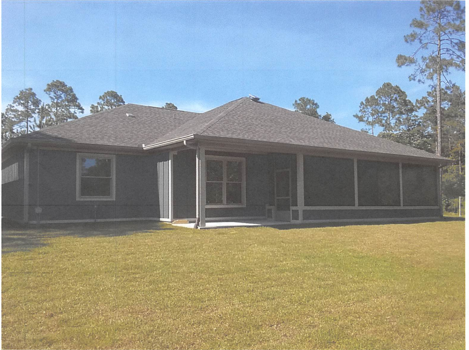
REAR VIEW 5/12/2016

If submitting more photographs than will fit on the preceding page, affix the additional photographs below. Identify all photographs with: date taken; "Front View" and "Rear View"; and, if required, "Right Side View" and "Left Side View." When applicable, photographs must show the foundation with representative examples of the flood openings or vents, as indicated in Section A8.