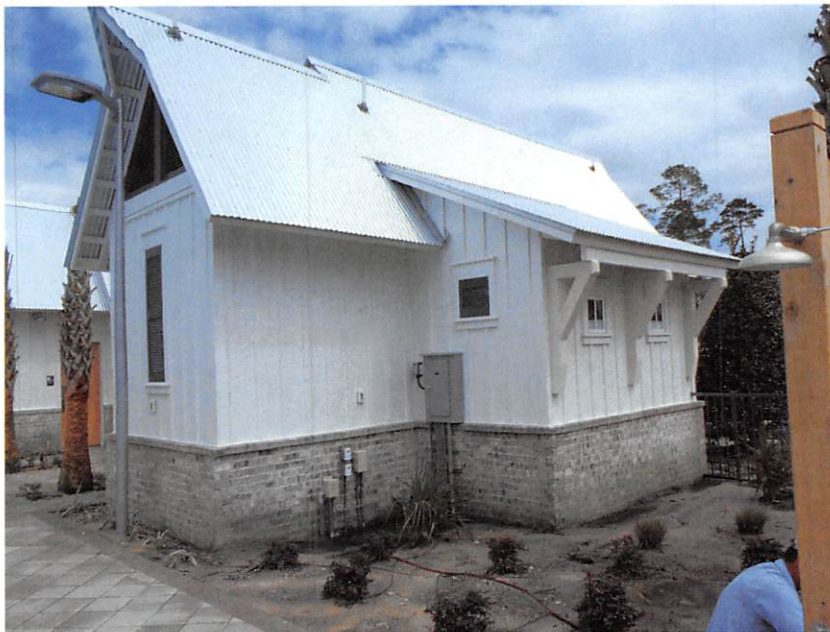
REAR VIEW 3-28-16