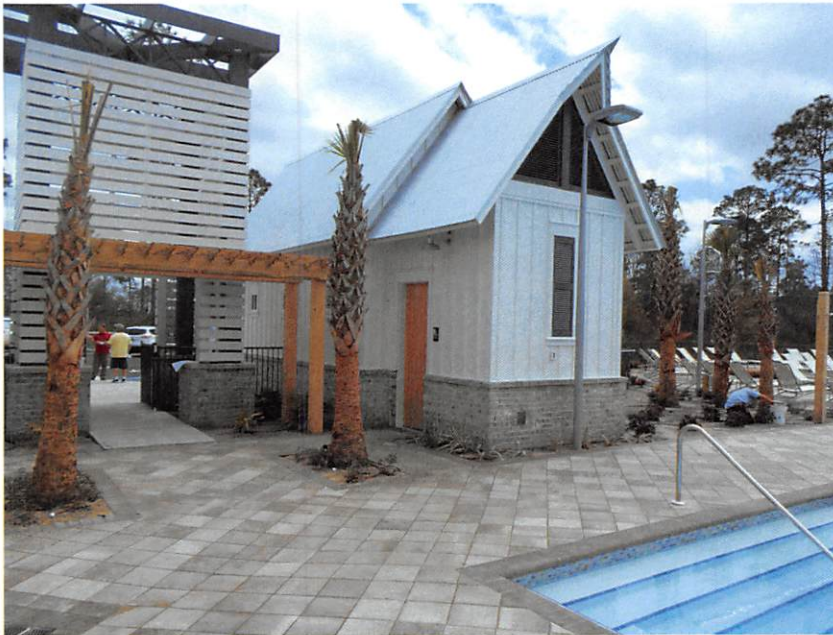
FRONT VIEW 3-28-16

If using the Elevation Certificate to obtain NFIP flood insurance, affix at least 2 building photographs below according to the instructions for Item A6. Identify all photographs with date taken; "Front View" and "Rear View"; and, if required, "Right Side View" and "Left Side View." When applicable, photographs must show the foundation with representative examples of the flood openings or vents, as indicated in Section A8. If submitting more photographs than will fit on this page, use the Continuation Page.