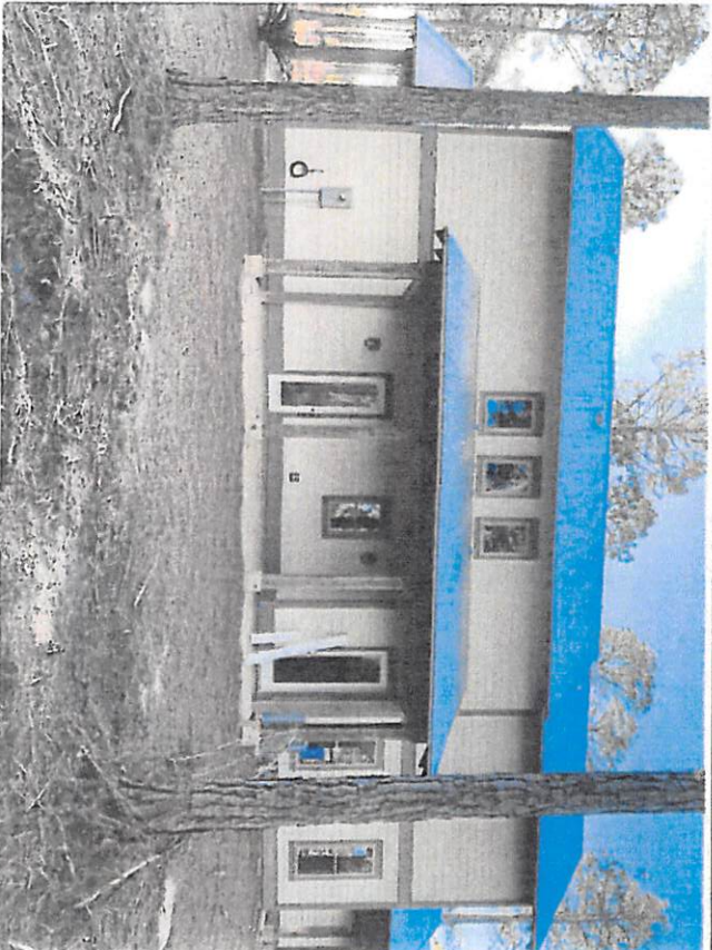
Photo Two Caption REAR OF RESIDENCE