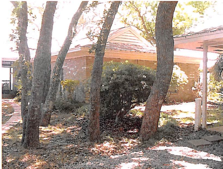
FRONT VIEW (5-13-14)

If using the Elevation Certificate to obtain NFIP flood insurance, affix at least two building photographs below according to the instructions for Item A6. Identify all photographs with: date taken; "Front View" and "Rear View"; and, if required, "Right Side View" and "Left Side View." If submitting more photographs than will fit on this page, use the Continuation Page, following.