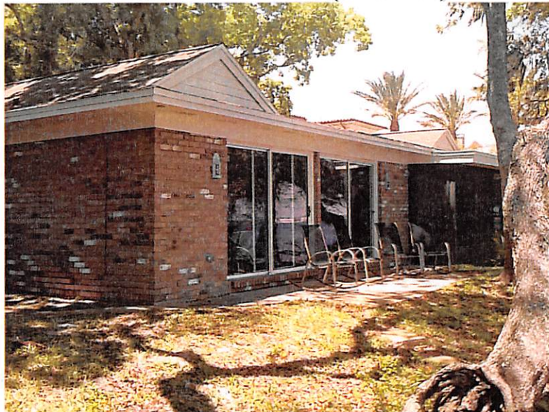
REAR VIEW (5-13-14)