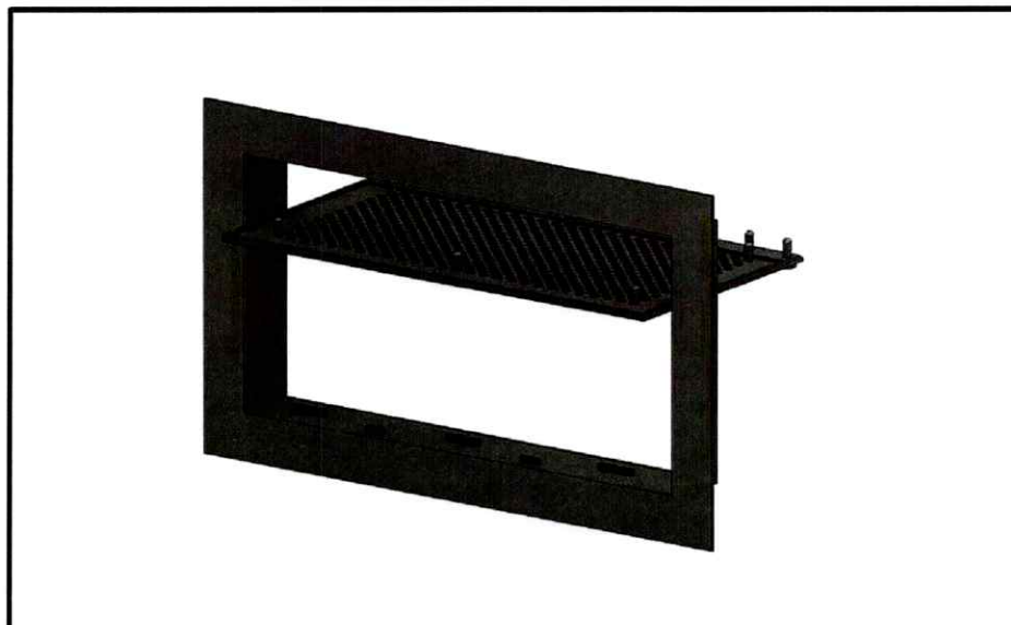
FIGURE 2—MODEL FFV-1608 FREEDOM FLOOD VENT™: SHOWN WITH FLOOD DOOR PIVOTED OPEN