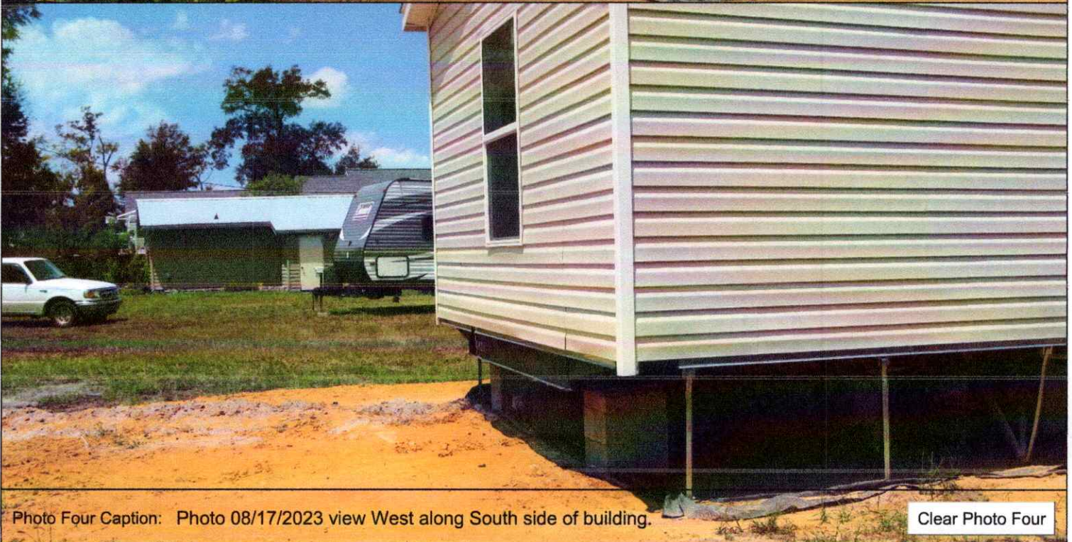
Photo Four Caption: Photo 08/17/2023 view West along South side of building.