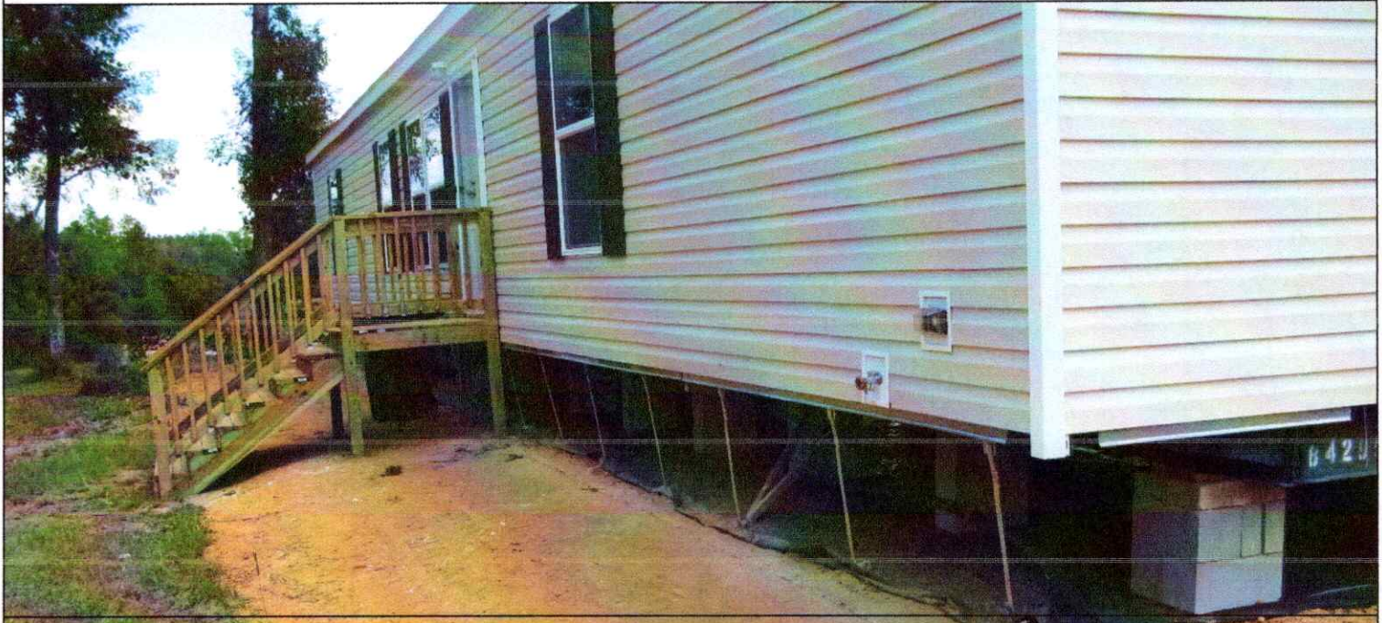
Photo One Caption: Photo 08/17/2023 view North along West side of building

Instructions: Insert below at least two and when possible four photographs showing each side of the building (for example, may only be able to take front and back pictures of townhouses/rowhouses). Identify all photographs with the date taken and "Front View," "Rear View," "Right Side View," or "Left Side View." Photographs must show the foundation. When flood openings are present, include at least one close-up photograph of representative flood openings or vents, as indicated in Sections A8 and A9.