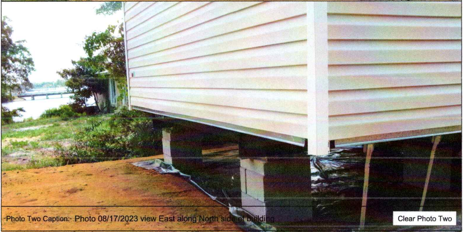
Photo Two Caption: Photo 08/17/2023 view East along North side of building