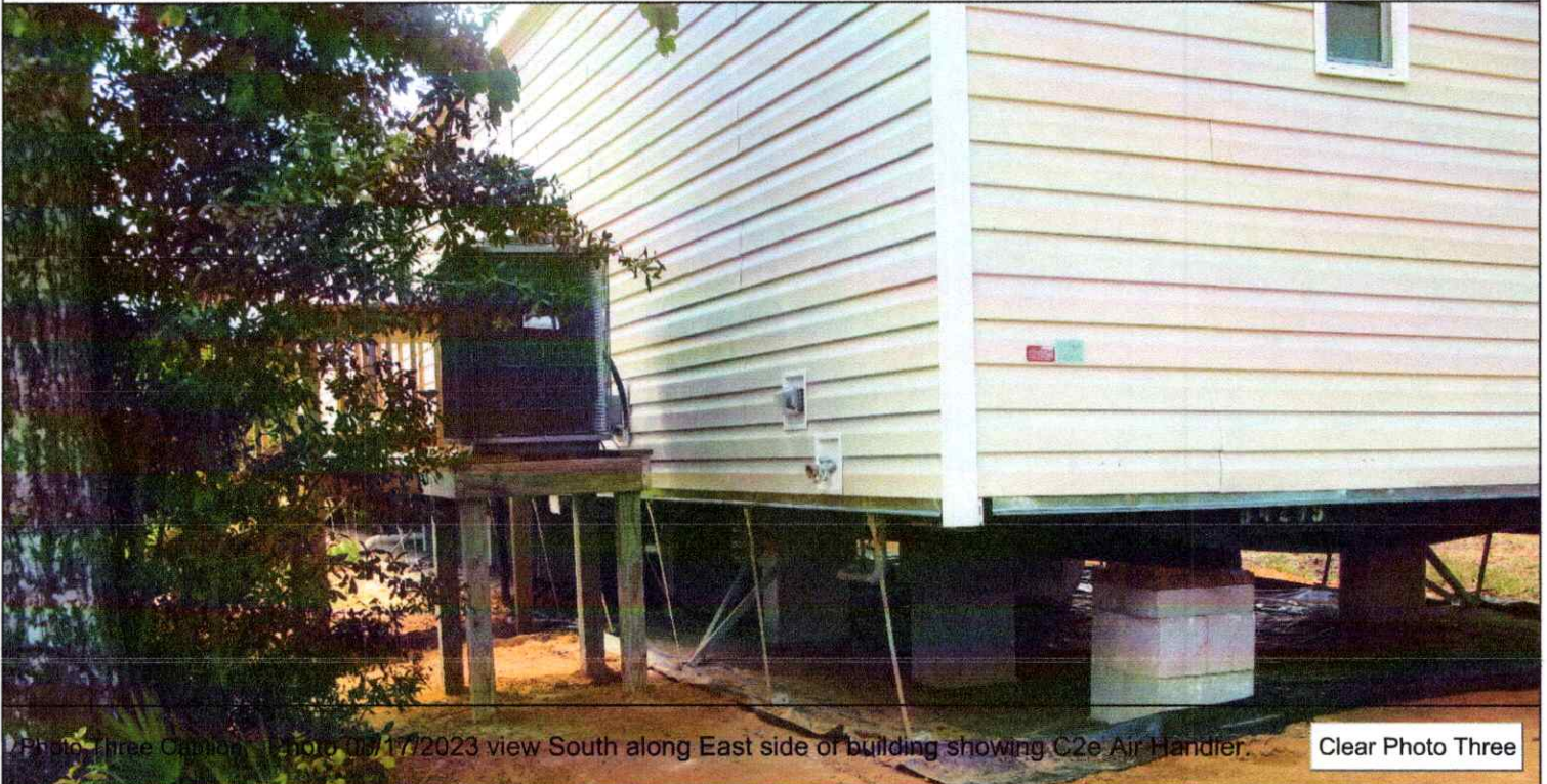
Photo Three Caption: Photo 08/17/2023 view South along East side of building showing C2e Air Handler.

Insert the third and fourth photographs below. Identify all photographs with the date taken and "Front View," "Rear View," "Right Side View," or "Left Side View." When flood openings are present, include at least one close-up photograph of representative flood openings or vents, as indicated in Sections A8 and A9.