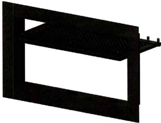
FIGURE 2—MODEL FFV-1608 FREEDOM FLOOD VENT®: SHOWN WITH FLOOD DOOR PIVOTED OPEN