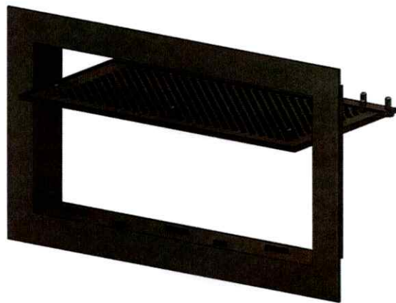
FIGURE 2—MODEL FFV-1608 FREEDOM FLOOD VENT®: SHOWN WITH FLOOD DOOR PIVOTED OPEN