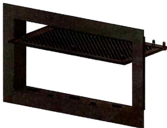
FIGURE 2—MODEL FFV-1608 FREEDOM FLOOD VENT®: SHOWN WITH FLOOD DOOR PIVOTED OPEN