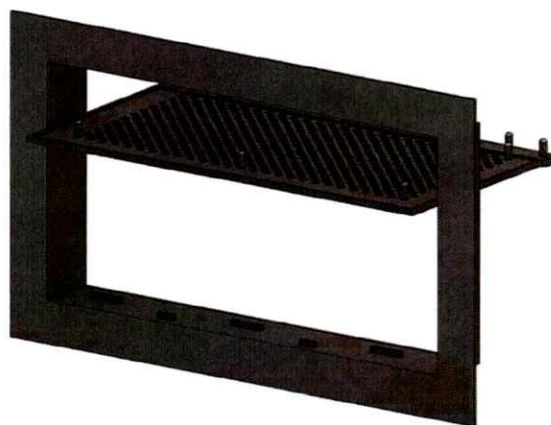
FIGURE 2—MODEL FFV-1608 FREEDOM FLOOD VENT ® : SHOWN WITH FLOOD DOOR PIVOTED OPEN