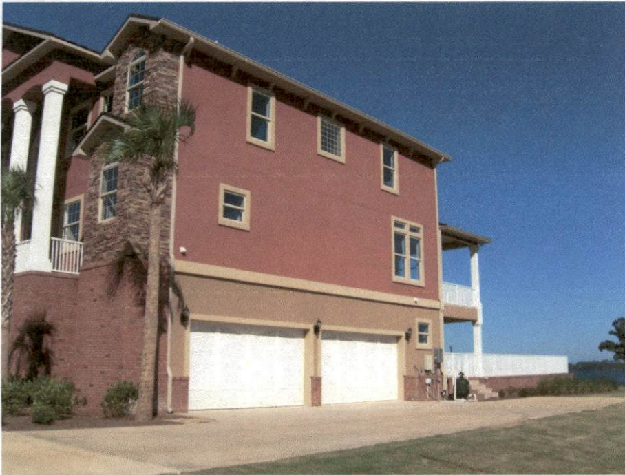
West Side View