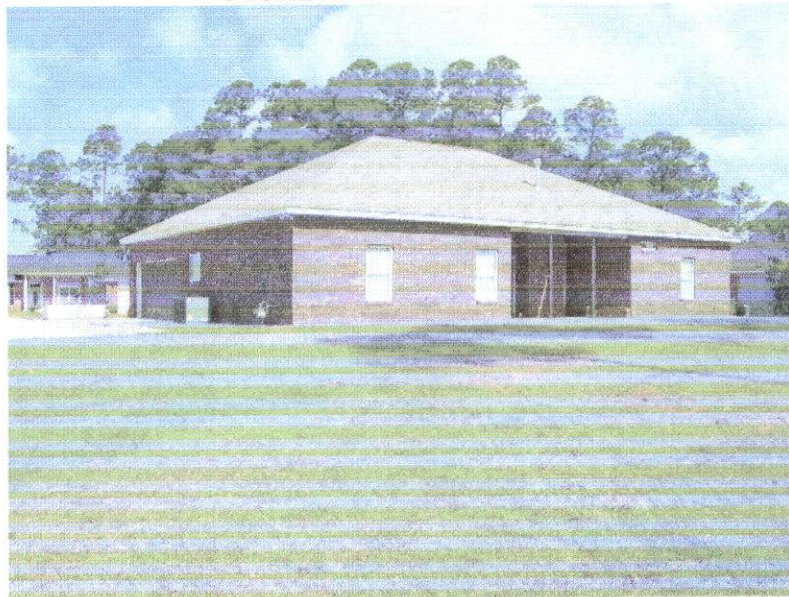
6 JUNE 2007 -- REAR VIEW