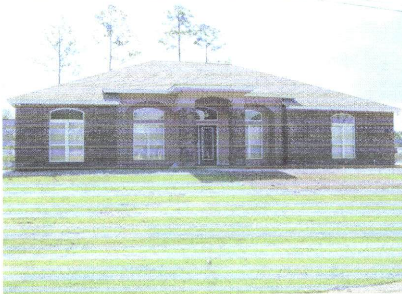
6 JUNE 2007 -- FRONT VIEW

If using the Elevation Certificate to obtain NFIP flood insurance, affix at least two building photographs below according to the instructions for Item A6. Identify all photographs with: date taken; "Front View" and "Rear View"; and, if required, "Right Side View" and "Left Side View." If submitting more photographs than will fit on this page, use the Continuation Page, following.