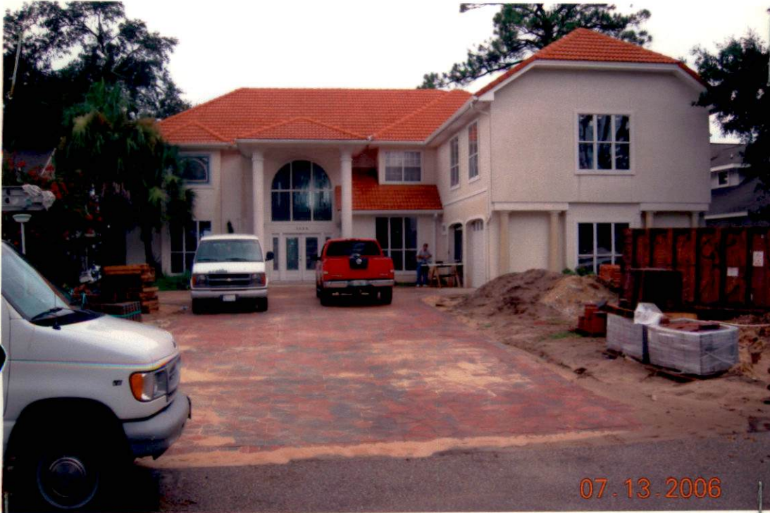
FRONT VIEW 7-13-06

If using the Elevation Certificate to obtain NFIP flood insurance, affix at least two building photographs below according to the instructions for Item A6. Identify all photographs with: date taken; "Front View" and "Rear View"; and, if required, "Right Side View" and "Left Side View." If submitting more photographs than will fit on this page, use the Continuation Page, following.