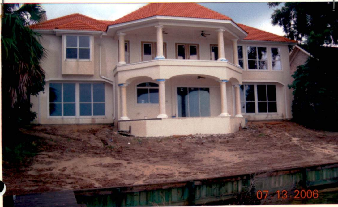
REAR VIEW 7-13-06