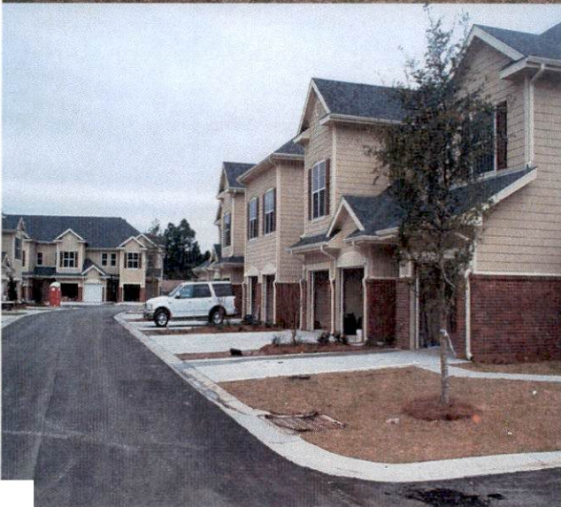
Bldg. 15 Front view (taken 2/14/07)