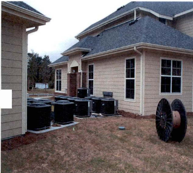
Bldg. 15 Right side view (taken 2/14/07)