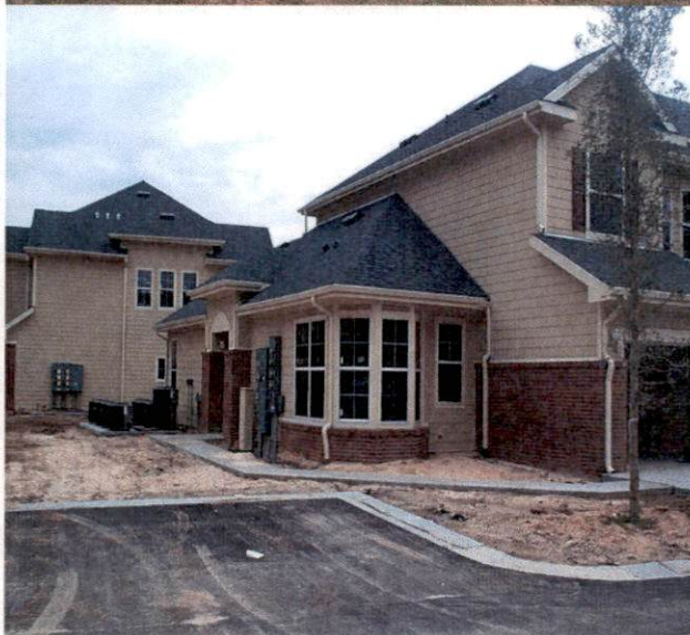
Bldg. 15 Left side view (taken 2/14/07)