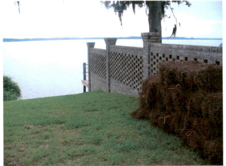
View of Retainer Wall on West Side