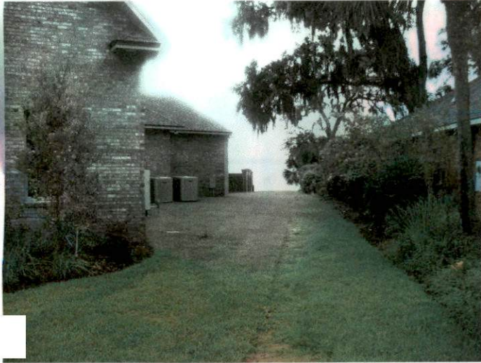
East Side View of Generator & A/C Pads