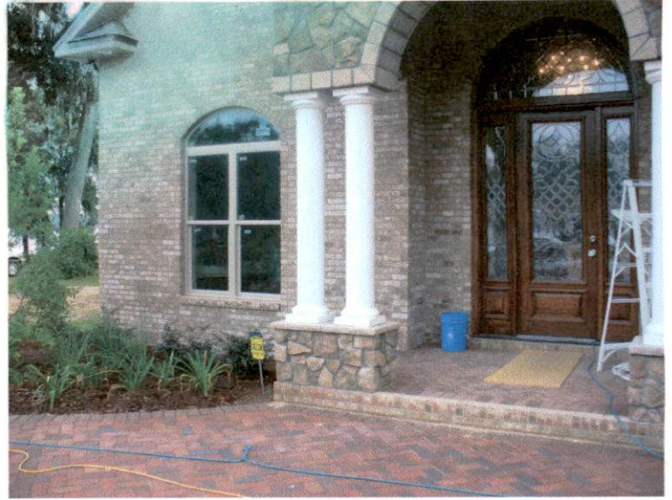
Front Westerly View