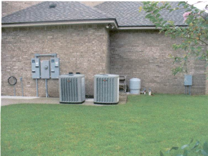
East Side View with A/C Pads