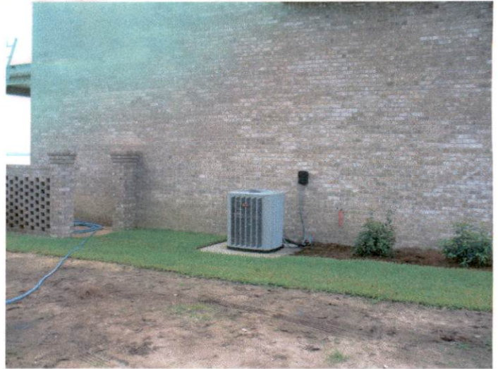
West Side View with lowest A/C Pad