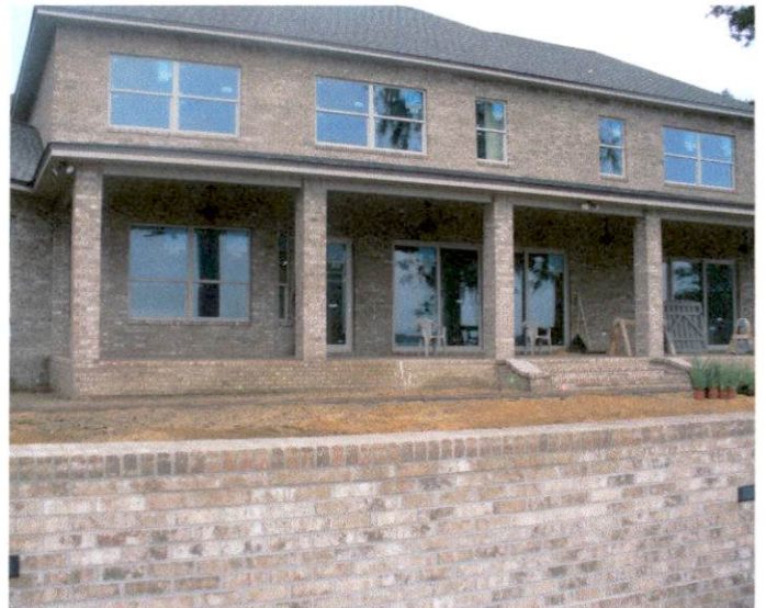
Rear View with Retainer Wall