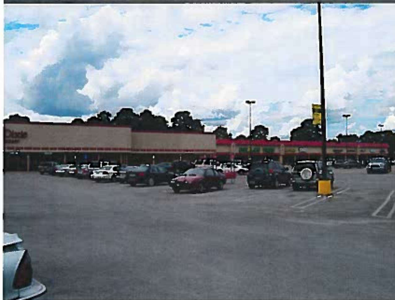
22 AUGUST 2012 -- FRONT VIEW