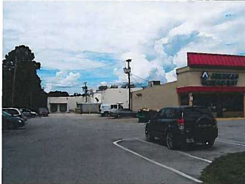
22 AUGUST 2012 - REAR VIEW